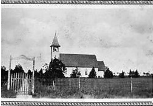
St. Ansgar's Lutheran Church