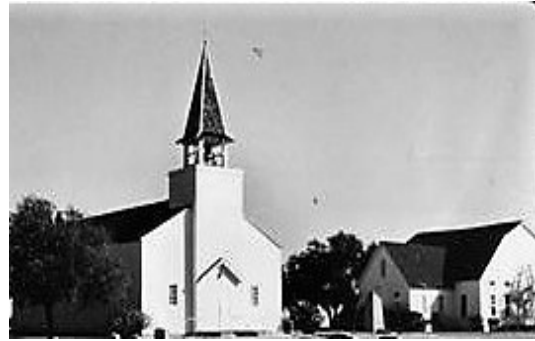
Danevang Lutheran Church

Photographs from University of North Texas Libraries, The Portal to Texas History, https://texashistory.unt.edu , crediting the Danish Heritage Preservation Society